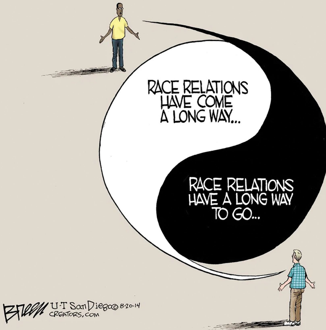
(Graphic by Stephen Breen, San Diego Union Tribune . Used with permission)

racism's impact on Black farmers today by establishing a program designed to compensate for historical discrimination. The Outreach and Assistance for Socially Disadvantaged and Veteran Farmers and Ranchers Program is part of the American Rescue Plan Act of 2021 and specifically includes Black farmers or families penalized by earlier institutional discrimination.